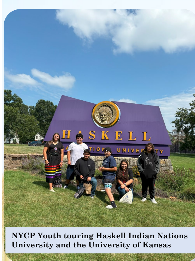
NYCP Youth touring Haskell Indian Nations University and the University of Kansas